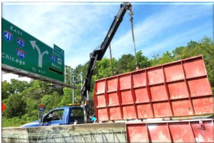
Milwaukee's Zoo Interchange Project

Zignego was able to slipform some of the standard median barrier, but a substantial amount required manual