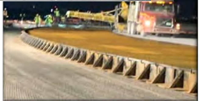
Kiewit Infrastructure South Co. at Hartsfield Jackson Atlanta International Airport

Normally heavy-duty paving forms are used to place straight highway lanes or straight airport runways and taxiways. Some curved (radius) pavement requirements at the Atlanta airport, however, necessitated the use of non-standard paving forms. MFC responded by supplying custom heavy-duty forms with the ability to be flexible for radius work while at the same time having the rigidity to support the weight of heavy concrete finishing machines.