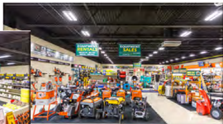
East Hartford Showroom