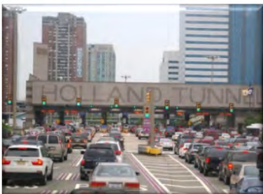
GEORGE WASHINGTON BRIDGE & HOLLAND TUNNEL

In retrospect, it seems that "tolling" is a practical way to fund, finance and sustain our roads, bridges and tunnels. It's a classic "user fee" because drivers only pay when they use it. It's hardly a new concept since paying money for road use has existed for over 2,700 years. Tolls were used by travelers using the Susa-Babylon highway in Persia in the 7th century. In the US, prior to the federally financed Interstate Highway System, many states created toll roads, bridges and tunnels. Three well-known examples are the Holland Tunnel which opened in 1927, the Golden Gate Bridge built during the Great Depression and the Pennsylvania Turnpike completed in 1940.