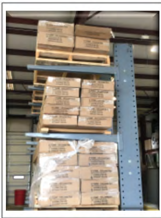
Racks of inventory Form Tech's Raleigh, NC facility

To this very day, Form Tech continues to have a strong focus on concrete wall construction; however, over the years, the company has made a concerted effort to expand into other types of concrete forming. This is when MFC first entered into the Form Tech product portfolio picture. Meager sales began eight years ago and started to escalate when Form Tech first became an MFC Master Dealer in 2016. Since that time, sales of MFC products have mushroomed to the point that all Form Tech regional locations are selling stocked products (Poly Meta Forms® as well as Metaforms® steel flatwork and Curb & Gutter forms) along with specialty paving and barrier forms and even the occasional concrete finishing screed.