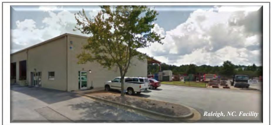
Raleigh, NC. Facility

The successful partnership developed between Form Tech and MFC did not happen by accident. It took dedication and trust between the two companies. It started when Form Tech made a deep commitment to “accessories” (non-wall forming products) and MFC in turn, made a strong effort to support this product line expansion. Form Tech began stocking steel and poly flat-work forms and MFC responded by conducting sales training seminars as well as traveling in the field with territory salesman. The latest example of Form Tech’s commitment is an e-mail advertising campaign promoting MFC steel and poly concrete forming systems. (example on back page)