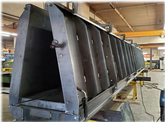
In shop photo

The demand for temporary concrete barrier has swelled due to highway department requirements to safely protect roadside construction workers from passing traffic.