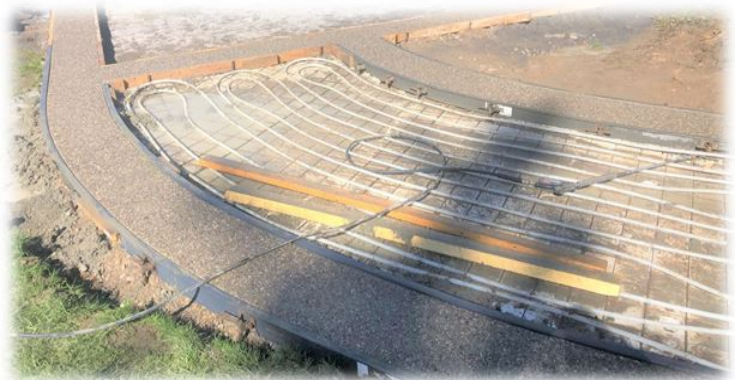
Poly Meta Forms® used to form exposed concrete border.

Why the dramatic increase in sales? There are several factors, but what stands out is the effort by Form & Build to coordinate inventory levels with sales promotions and customer expectations. The management team at Form & Build realizes that promoting particular products or brands (Poly Meta Forms® for example) without adequate inventory levels can result in disappointed customers. Conversely, highlighting in-stock products with email blasts, in-store promotions and demos is a "win/win" strategy. In other words, (again using Poly Meta Forms® as an example), convince the contractor that MFC's reusable and lightweight poly forms are a great investment and then close the deal by having the product immediately available for pickup or delivery.