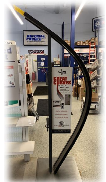
Form & Build Supply, Inc. Poly Meta Forms® display

MFC is proud of the well-grounded partnership with Form & Build and is looking forward to continuing to build a strong bond with our Canadian friends across the border. Congratulations to Form & Build as it celebrates its 45th anniversary of faithfully supplying and supporting the Ontario construction industry.