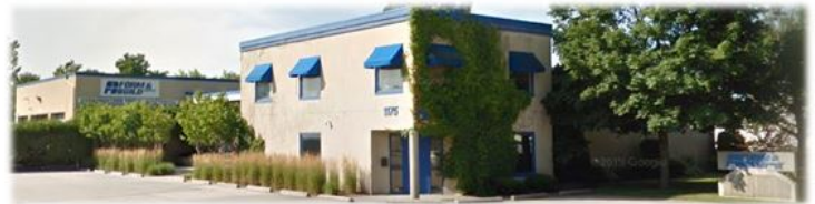
Form and Build Supply - London, ON, Canada

Oftentimes the name of a construction supply dealer can be misleading or, at the very least, nondescript. Nothing wrong with the name "Smith Distribution", but it doesn't immediately translate to an outlet for concrete contractor supplies. In the case of Form & Build Supply, Inc., it is a very appropriate name for a company that distributes MFC's concrete forming products. The contractors served by Form & Build literally "form & build" with MFC's steel and poly forms for concrete construction.