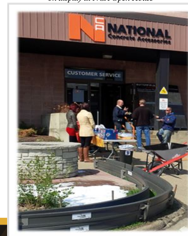
Poly Meta Forms® and Sterling Wheelbarrows on display at NCA Open House