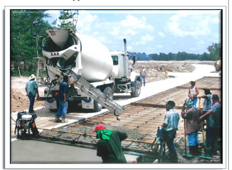
Houston Subdivision Paving

The relationship of MFC, CPSI and Beyer Construction illustrates a cooperative effort that leads to unparalleled success at all three levels of manufacturer, supplier and contractor.